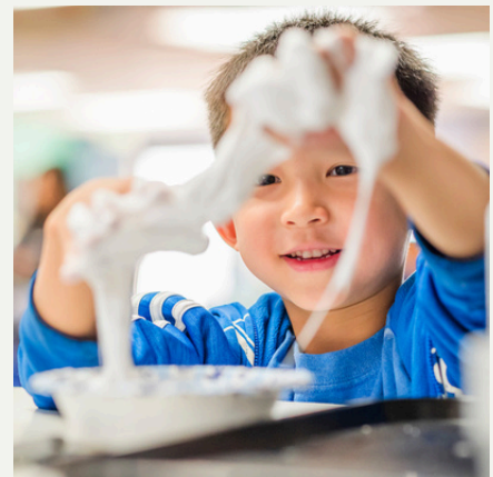
Building Community & Sparking Creativity at Klassic Kids

Impact: Serving nearly 600 students year-round.