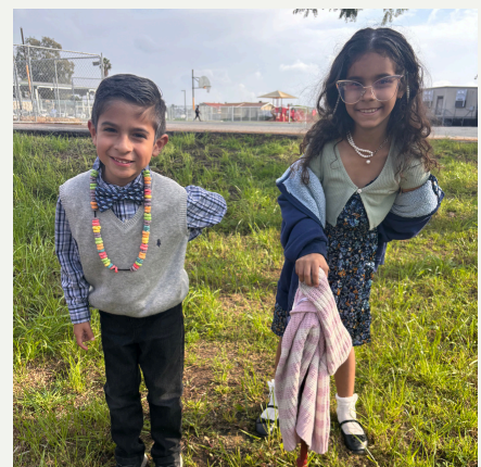
Celebrating 100 Days of Learning with PrimeTime

Impact: Providing services to over 5,800 students, including morning, afternoon, and Summer 2025 enrollment.