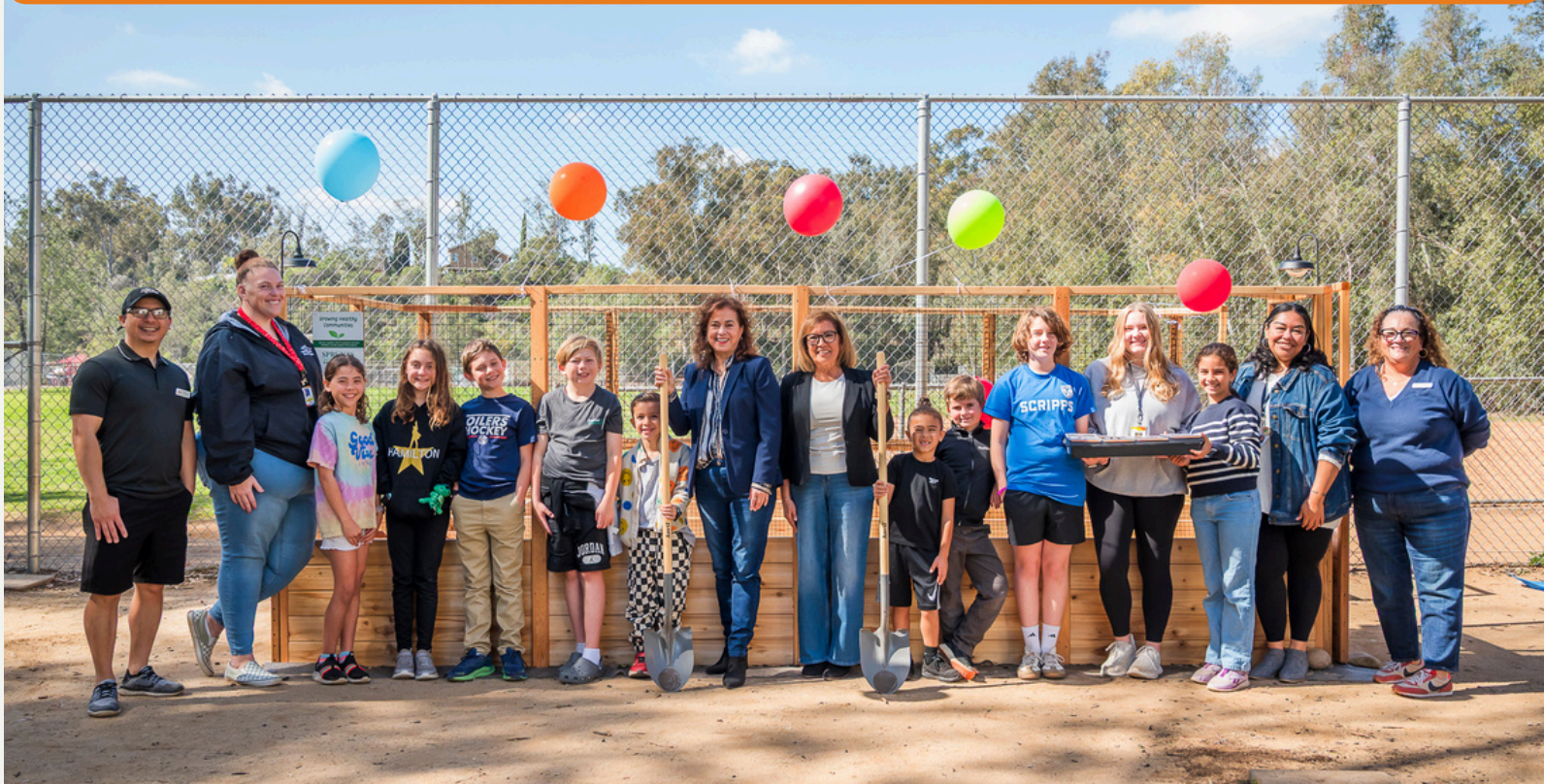
Klassic Kids Sprouts Garden – Where Growth is Celebrated

Marina Village | Seaside Room 1970 Quivira Way San Diego, CA 92109 Thursday, July 16, 2026, 5:30 PM