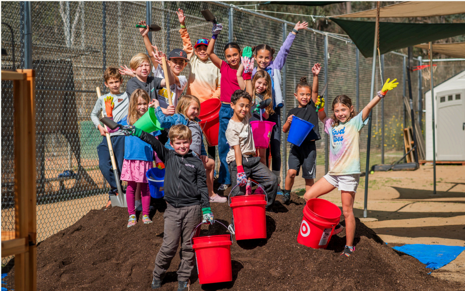
Klassic Kids Sprouts Garden – Where Learning Grows

An inclusive and equitable world where all children, youth, and their families flourish and realize their fullest potential.